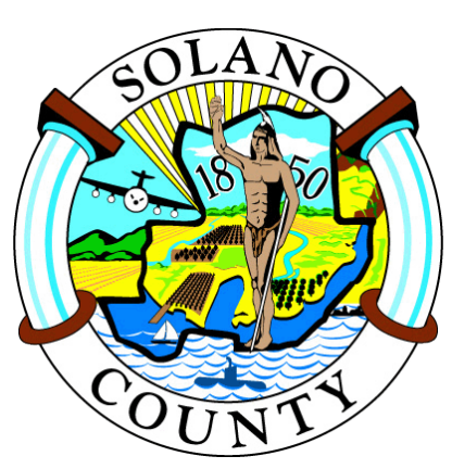
Made possible by funding from Solano County